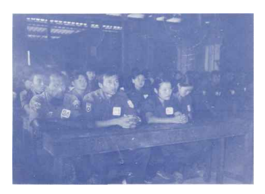
1986/87 Basic Medical Training Class.