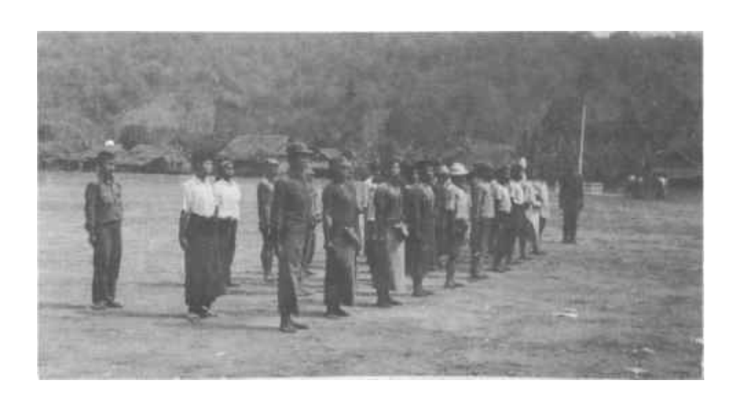
Some new young men lining up for their 1st parade.