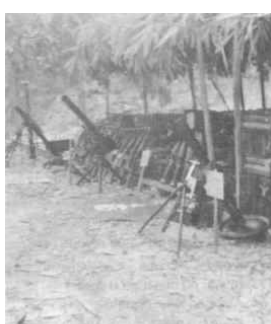
Some arms and ammunitions captured at Ka daing ti.