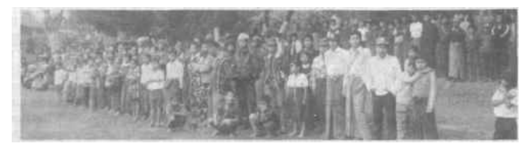
Masses attending 38th Karen Revolution Day at Manerplaw.

The noble and righteous Karen revolution is bound to be victorious.