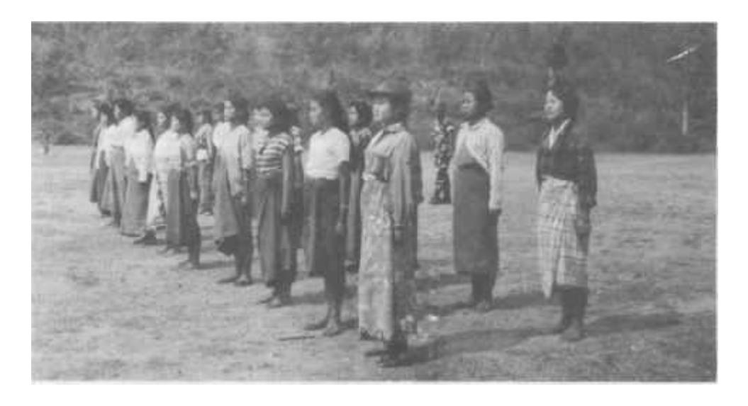
Some young girls at their 1st parade.