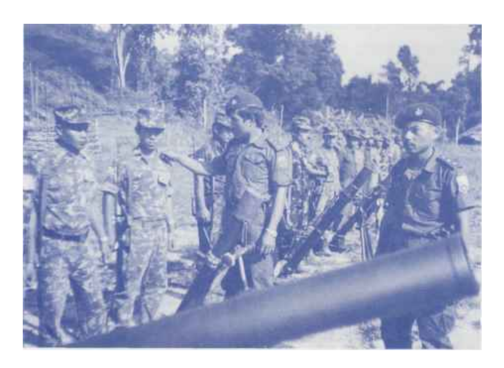
Heavy Arms training at GHQ.