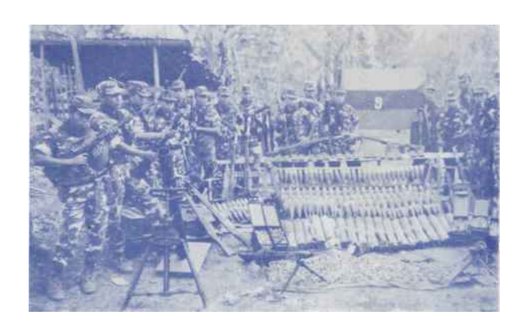
KNLA 7 Bde. captured enemy arms from Ta-la Aw Lu on 26-2-87.